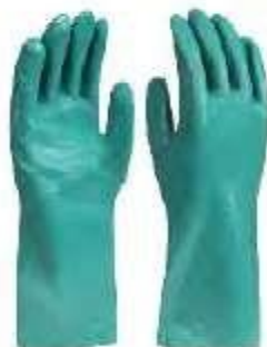
Nitrile Flocklined Hand Gloves