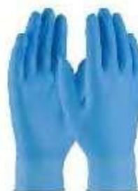
Nitrile Disposable Hand Gloves