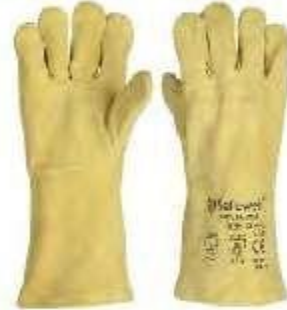
Yellow Split Leather Welding Hand Gloves with Cotton Lining