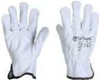
Chrome Leather Driving Hand Gloves