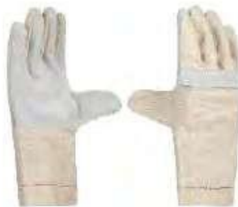
Leather Canvas Hand Gloves