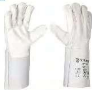
Combination Leather Welding Hand Gloves. Back of Split Leather and Palm of Chrome Leather