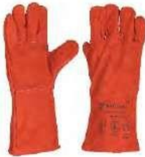
Red Split Leather Welding Hand Gloves with Cotton Lining