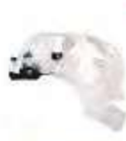
Pin Lock Fitting